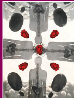
Tobin W. Keller

October 5–October 30 Reception: October 3, 5:30pm–7:00pm Artist Talk: October 7, 6:30pm VAPA Room 1001 (lower campus) Closing Reception: October 28, 4:30pm–6:00pm